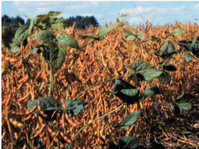
Figure 1. Symptoms of green stem at harvest

The incidence of green stem syndrome (unofficial common name) has been observed for years, but has increased dramatically since 1995. The name is descriptive of plants that retain green stems well past the point of normal maturity (Figure 1).