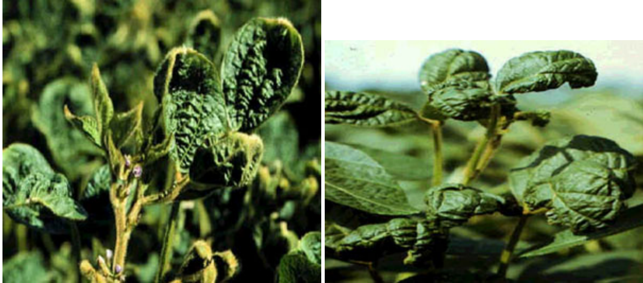
Figure 5. Diagnosing herbicide injury versus virus infection can be difficult due to the similarity of symptoms. Dicamba injury (left) causes cupping up of the leaves, while SMV infection(right) is characterized with downward cupping of the leaves.