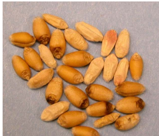
Image 1. Scabby and Tombstone Kernels

If growers absolutely need to plant saved seed due to availability or other economic considerations, the following steps should be taken to increase the likelihood of establishing a legal and good wheat crop: