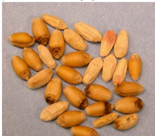
Image 1. Scabby and Tombstone Kernels

If growers absolutely need to plant saved seed due to availability or other economic considerations, the following steps should be taken to increase the likelihood of establishing a legal and good wheat crop: