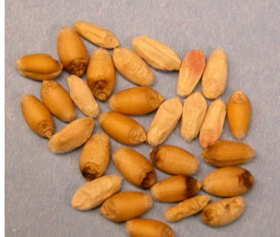
Image 1. Scabby and Tombstone Kernels

If growers absolutely need to plant saved seed due to availability or other economic considerations, the following steps should be taken to increase the likelihood of establishing a legal and good wheat crop: