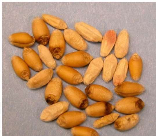
Image 1. Scabby and Tombstone Kernels

If growers absolutely need to plant saved seed due to availability or other economic considerations, the following steps should be taken to increase the likelihood of establishing a legal and good wheat crop: