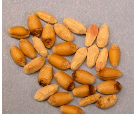
Image 1. Scabby and Tombstone Kernels

If growers absolutely need to plant saved seed due to availability or other economic considerations, the following steps should be taken to increase the likelihood of establishing a legal and good wheat crop: